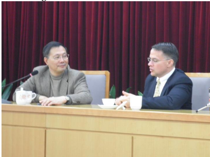
On another occasion (above right & below), we used an auditorium and a banquet hall to host a joint class and luncheon for our Chinese and American students from ECUPL, SJTU, and ECNU.