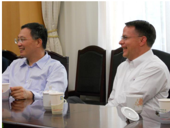
Above, we held Q&A with American students in a conference room in the main building. Below, we regularly taught joint classes for our ECUPL and SJTU students in a seminar room in Building 4.