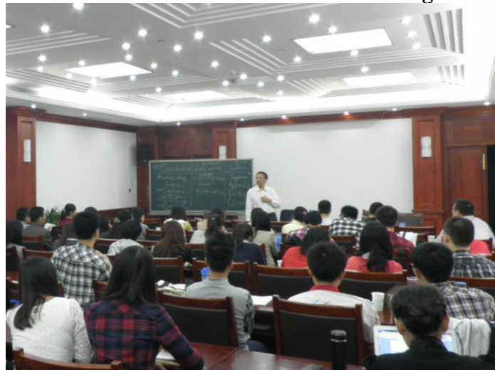
Our constant theme was the rule of law: government according to law, with each office and official performing their duties according to published rules. Below, we discussed a basic framework.